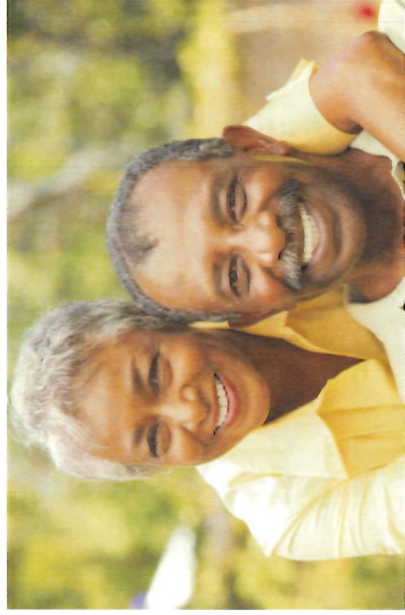
WASHOE COUNTY SENIOR SERVICES PROVIDES AN ARRAY OF SERVICES!

Mon - Fri, 8:00 am - 5:00 pm Lunch served - 11:15 am - 12:30 pm (775) 328-2575 1155 E. 9th Street, Reno